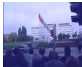
Protesting in front of the European Parliament

Macedonians are the only unrecognised ethnic minority in Bulgaria. Other ethnic groups enjoy recognition and protection under the Framework Convention for the Protection of National Minorities, to which Bulgaria is a party. Bulgaria has limited the scope of the Convention to exclude the Macedonian minority, claiming that although 5,071 persons declared an ethnic Macedonian identity at the 2001 census, such persons do not meet "subjective criteria" required for recognition as a distinct minority (i.e. they are not culturally different to ethnic Bulgarians).