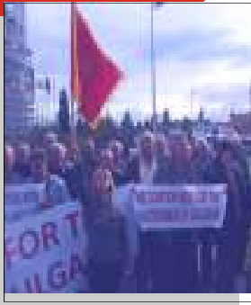
Waving the Macedonian flag in front of the European Parliament

"...the aims of the protests are to raise awareness in the European Parliament of the plight of the unrecognised Macedonian minority of Bulgaria"