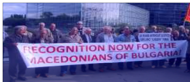
Macedonians from Bulgaria protesting for the recognition of their culture

"UMO "Ilinden" PIRIN is the only party in Bulgaria which openly defends the rights of the ethnic Macedonians in the country."