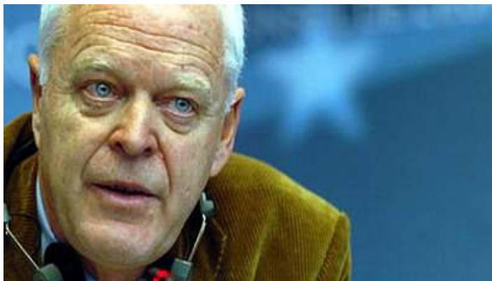
Thomas Hammarberg.

"The AMHRC not only reiterates the suggestion in the title to Mr Hammarberg's statement that Bulgaria make more efforts to protect the rights of its Macedonian minority, but asserts that this is a fundamental responsibility that it cannot avoid."