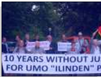
A group of protesters hold up a banner in an attempt to raise awareness of the plight of the Macedonian minority in Bulgaria

"...the aims of the protests are to raise awareness in the European Parliament of the plight of the unrecognised Macedonian minority of Bulgaria"