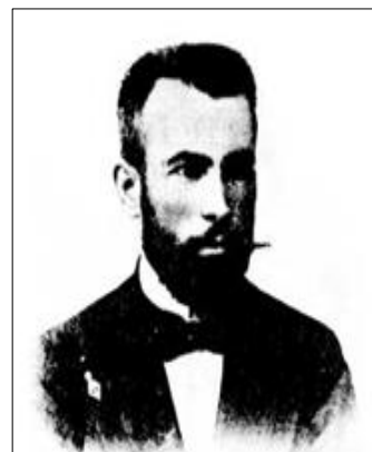
ФОНДАЦИЈА „КРСТЕ ПЕТКОВ МИСИРКОВ“ КАНЦЕЛАРИЈА ЗА ЊЕЧАЈ

Крсте Петков Мисирков беше роден на 18 Ноември 1874, во селото Постол/Пела, Отоманска империја (денешна Грција). Беше филолог, реформатор на стандардниот македонски јазик, историчар, етнолог, публицист и автор на првата книга и списание на стандардниот македонски јазик. Најпознатото дело на Мисирков е книгата „За македонските работи“, која беше издадена на 1903 год.